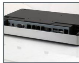
Rich I/O Ports Provide Excellent Peripheral Connectivity