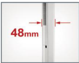
Ultra Slim, 48mm Thickness