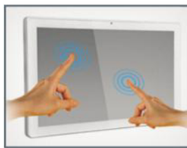
True-Flat Resistive Gesture Touch True-Flat Projected Capacitive Multi-Touch