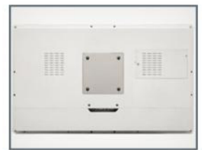
Aluminum Die Casting