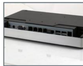
Rich I/O Ports Provide Excellent Peripheral Connectivity